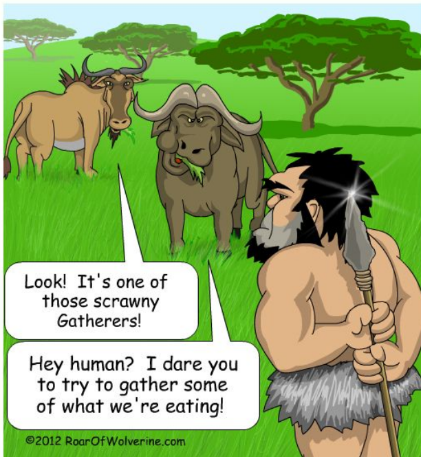
The day we added Hunter to Gatherer

sought after whatever tasted good and was available. We evolved to get the most out of the foods our ancestors ate.